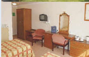
Hotel: The Beaufort Park Hotel, Mold, Flintshire CH7 6RQ Tel: 01352 758646

The Beaufort Park Hotel offers friendly, comfortable accommodation in a convenient location. It has a restaurant and bar. All rooms include en-suite bathrooms, hairdryer, tea and coffee making facilities, TV with satellite channels and a trouser press.